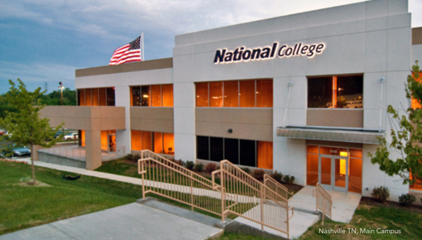
Nashville TN, Main Campus