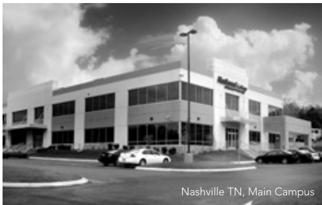
Nashville TN, Main Campus

The campus serving Tennessee’s capital city is conveniently located on Bell Road adjacent to the Bell Road Church of Christ and is easily accessible from I-65 (exit 78) and I-24 (exit 59). The campus is situated in the heart of a bustling metropolitan area, enabling our graduates to explore career opportunities across a wide range of businesses. This 31,000-square-foot campus houses 13 classrooms, six computer labs, a medical lab and information technology lab. Public transportation service is available to this location.