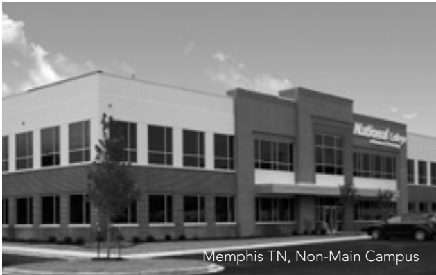
Memphis TN, Non-Main Campus

National College's Memphis campus is located in southeast Memphis in an area known for a solid business climate and supported by a diverse list of companies, enabling our graduates to explore career opportunities in a wide range of businesses. Conveniently located just off I-240 and Perkins Road (exit 18), the campus has helped working adults in the Memphis, North Mississippi and East Arkansas areas achieve their education goals since 2005 and continues to build on its reputation with local employers for its graduates. The new 30,000-square-foot campus includes fifteen classrooms, four computer labs and a medical lab.